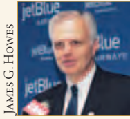
David Neeleman, founder of JetBlue Airways