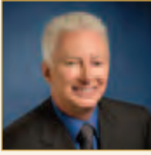
A G Lafley, former chairman, president and CEO of Procter & Gamble