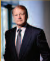
John Chambers, chairman and CEO of Cisco Systems, Inc