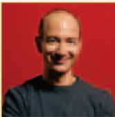
Pierre Omidyar, founder of eBay